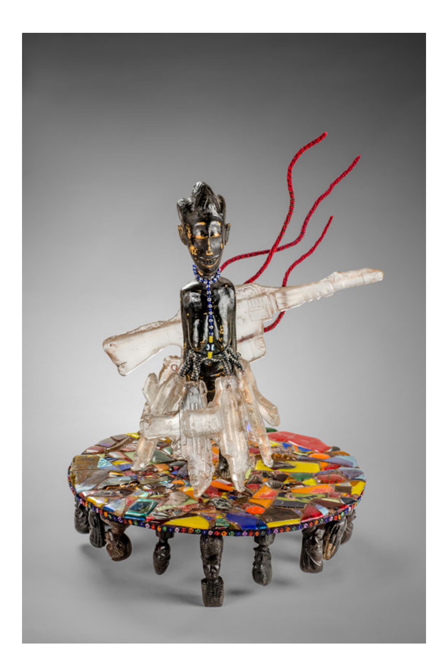
"War Woman II" by Joyce J. Scott, 2014. African sculpture, fused and painted mosaic glass, glass/plastic beads, wire, thread, metal keys and cast glass guns, 25 \times 18 \times 18 inches.