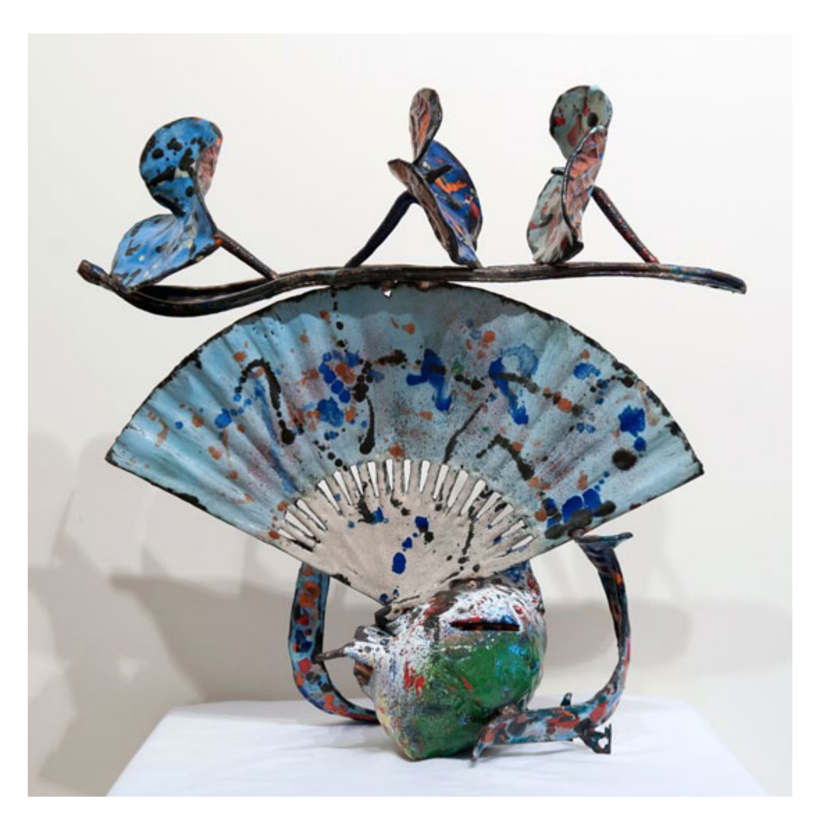
"Tanz (glass series)" by Nancy Graves, 1984. Baked enamel on bronze, 19 x 19 1/2 \times 10 inches. (Inv# FA591)