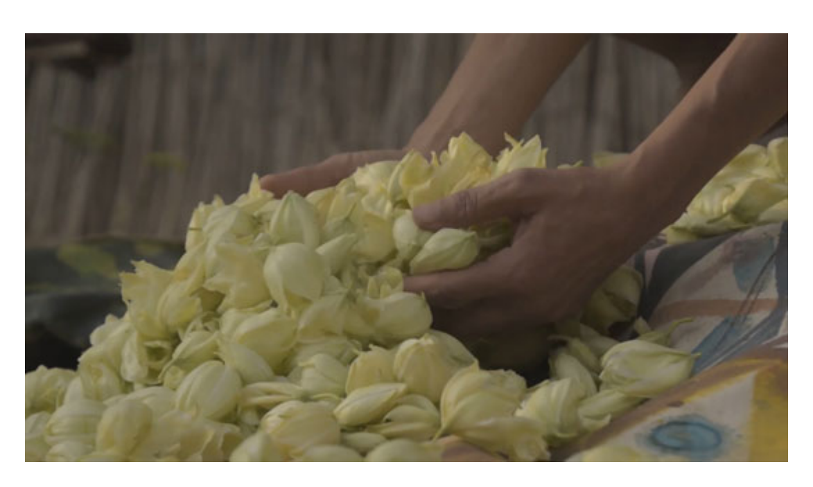
"Spread Wild: Pleasures of the Yucca" by Paula Wilson, 2018. Video with sound, 6:00 minutes.