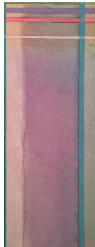
Andrew's Gift , 1973, acrylic on canvas; 27 x 10 ¼ inches.